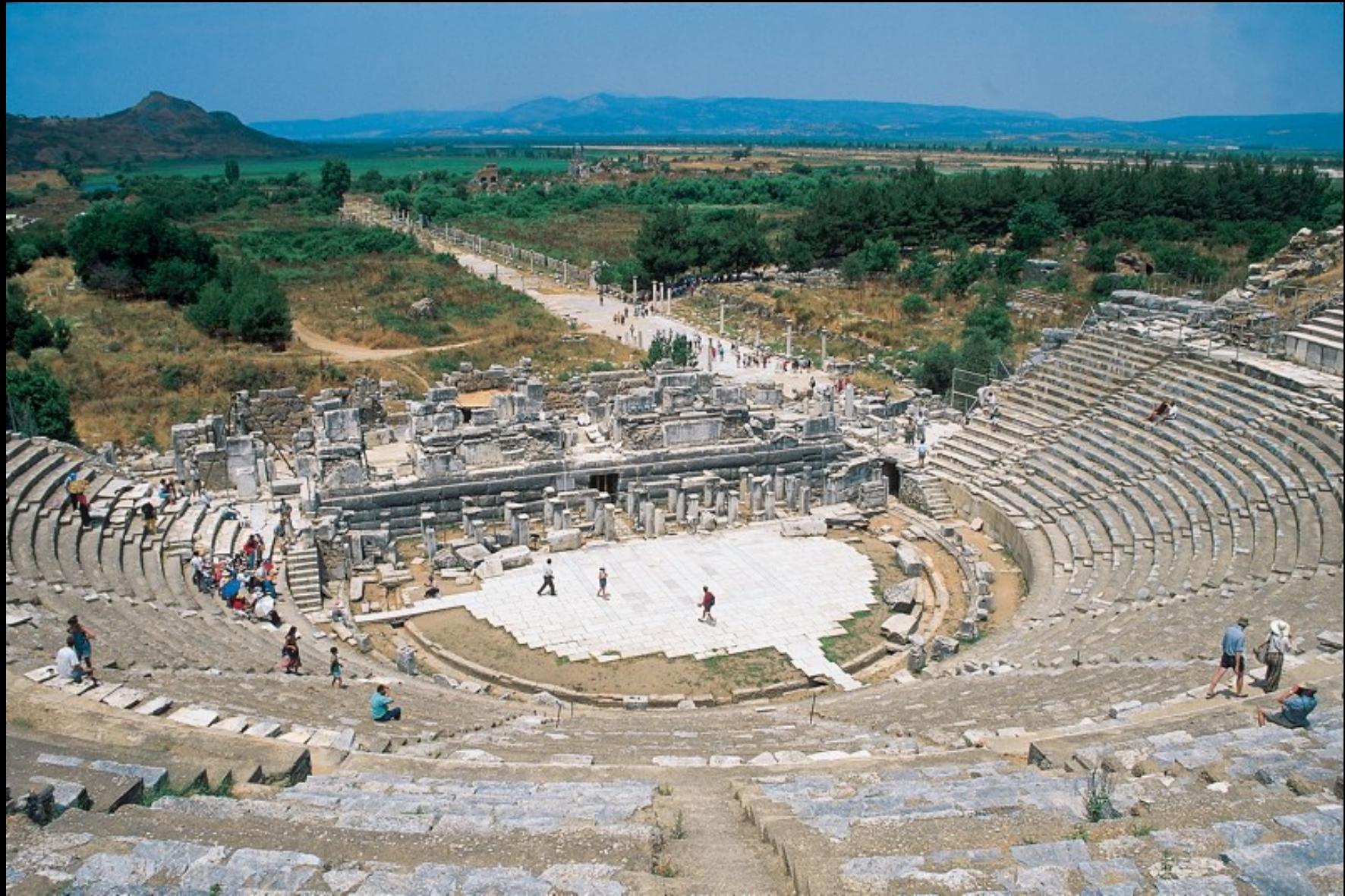
The Amphitheatre at Ephesus