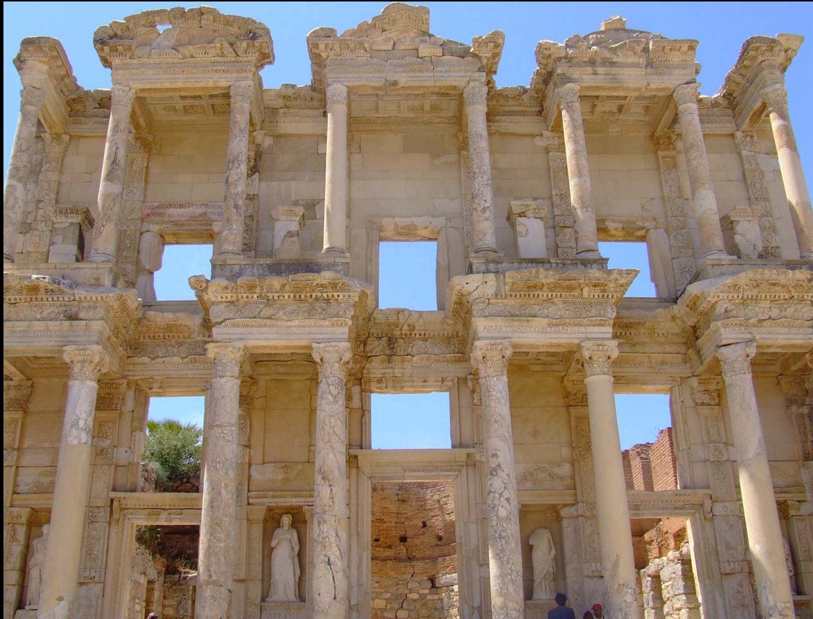
The Library of Celsus at Ephesus