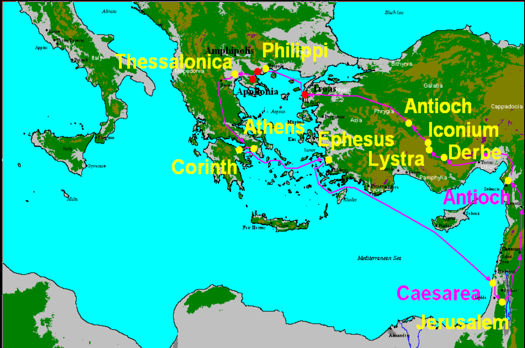
Paul's second missionary journey