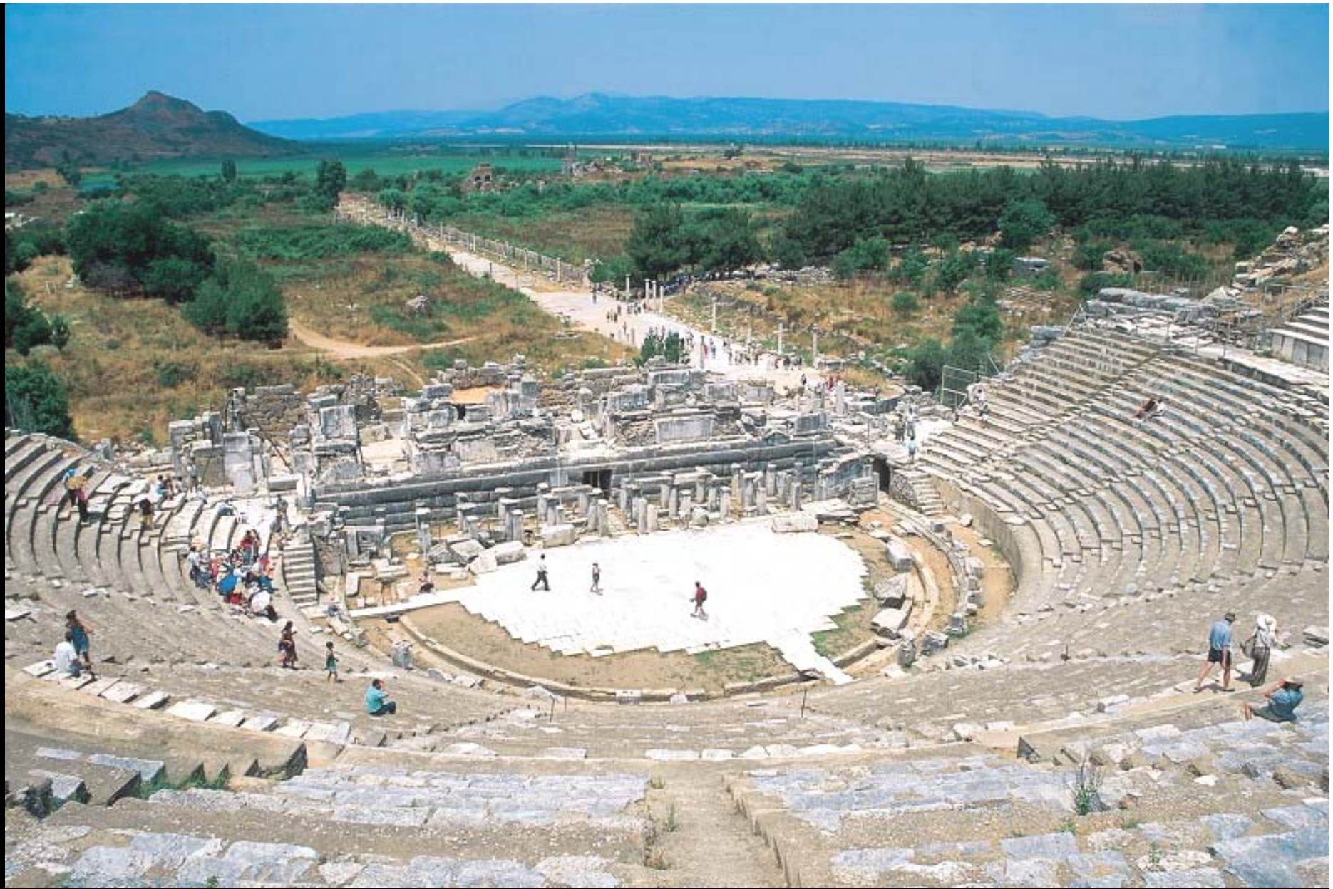
The Amphitheatre at Ephesus