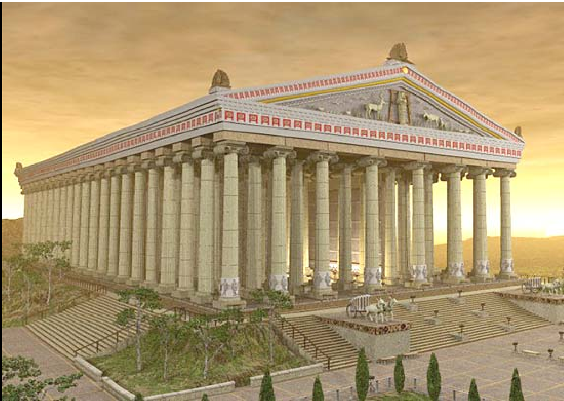
The Temple to Artemis (Diana) at Ephesus